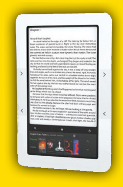
Barnes and Noble Nook