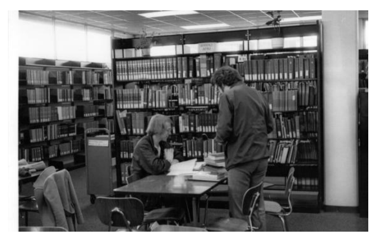
Students at the Music Library. Date: 1979 Did you know the Music Library currently owns 88,000 music books, scores, and recordings? All ECU and community patrons may access these Pirate treasures along with additional services and resources. Learn more when you watch the new video staring PeeDee the Pirate.