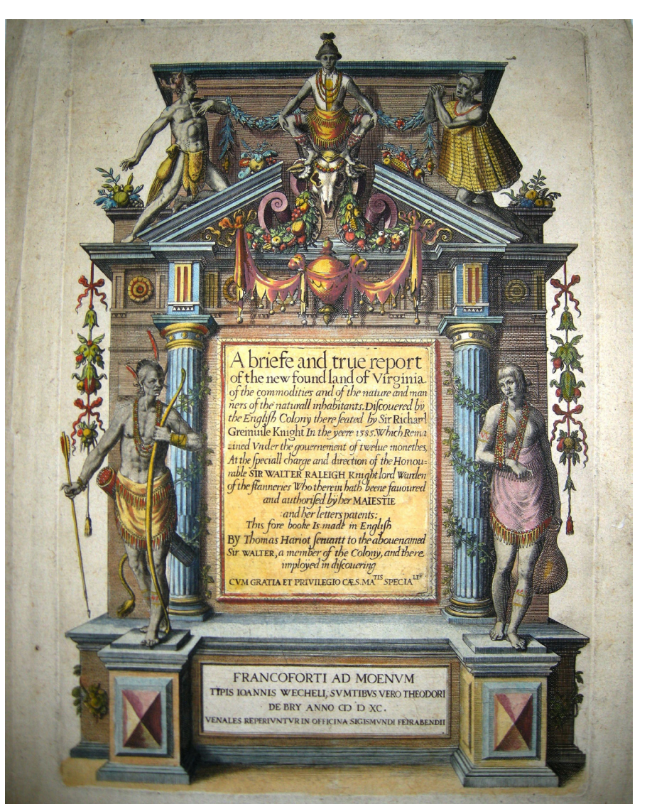
Title page of the 1590 English edition of A Briefe and True Report of the New Found Land of Virginia

Also on display will be a large print of "The Invincible Armada Defeated" depicting the English defeat of the Spanish Armada in 1588 along with prints depicting Sir Walter Raleigh and Queen Elizabeth I of England. In addition, the exhibit will include Raleigh's Historie of the World and an early biography of him.