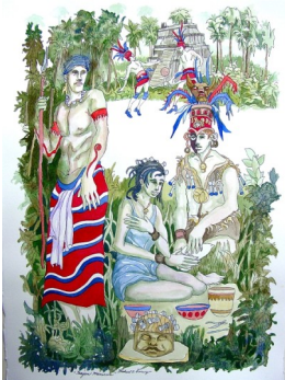
Mayan Manicure watercolor & ink, 19"x14", 2008

This month we will all be playing the same music!